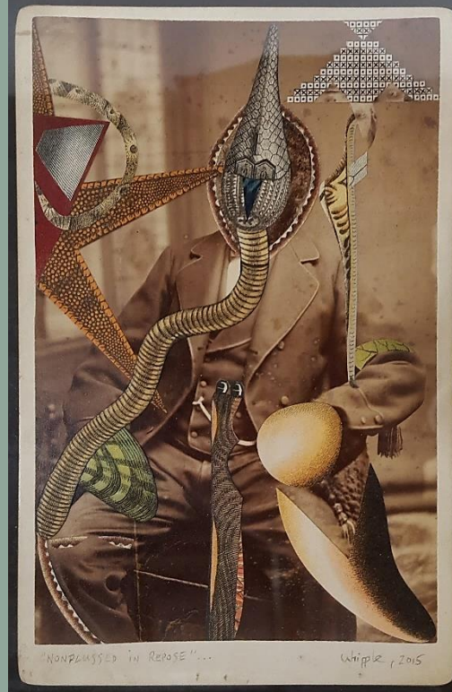
Nonplussed in Repose