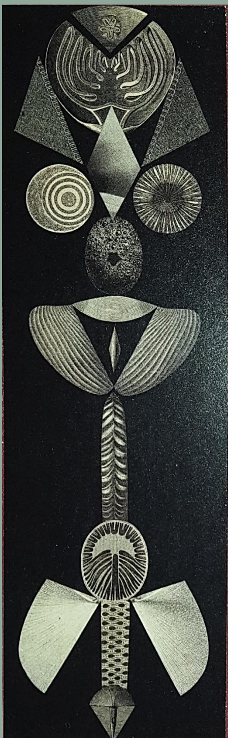
Token Totems 2017

Most recently, Mr. Whipple has made small totem images from mechanical illustrations and has collaged over and transformed cabinet card photographs. These were on display for CAA and showed a sense of wonder, intricacy, and finessed proportion.