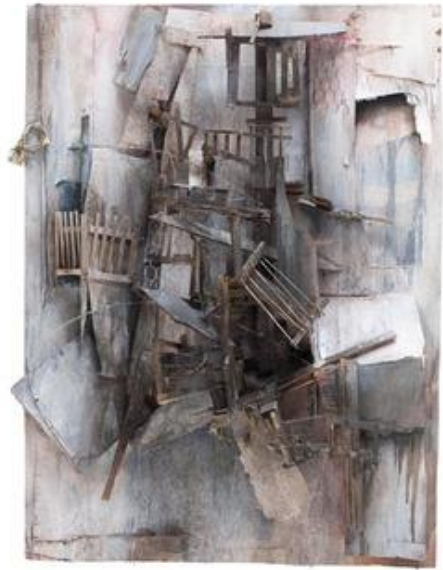
Vito LoRusso "Eagle Rock", Mixed Media, 2012