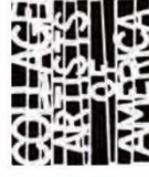
EXHIBIT ENTRY FORM

DO NOT SEPARATE TOP AND BOTTOM PORTIONS. ATTACH ENTIRE FORM TO BACK OF WORK IN UPPER RIGHT-HAND CORNER.