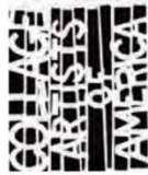
EXHIBIT ENTRY FORM

LIABILITY RELEASE By signing this form, artist agrees to release Collage Artists of America, its officers, members, and all galleries, organizations, agents, and personnel from liability for loss, theft, breakage, or damage to artworks artist has entered in Collage Artists of America exhibits. Artist agrees to entry terms as outlined in the prospectus.