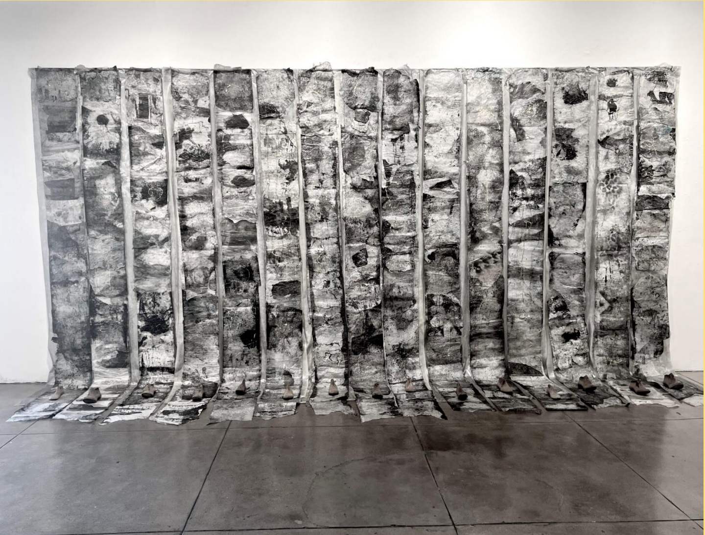
Kokytus: River of Lamentation, 2023, 10ft x 214", ink dyed wax paper, gold leaf, rose glitter spray and collage