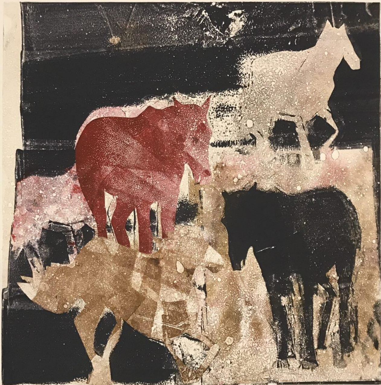
Susan Gesundheit, Mustang Red and Black , monotype, 18" x 18"