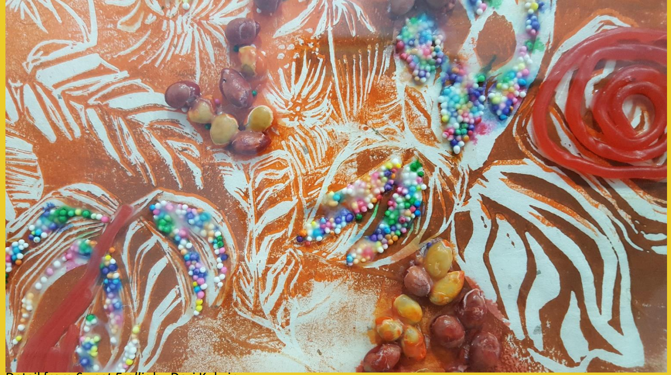
Detail from Sweet Frollic by Dori Kulwin

AT KOLAJ FEST NEW ORLEANS (sponsored by KOLAJ magazine July 10-14), questions were addressed by magazine co-founder Ric Kasini Kadour in a session about curatorial issues in collage exhibition (as opposed to curation issues by remix collage artists as part of their artmaking). Perhaps there is food for thought for CAA members: