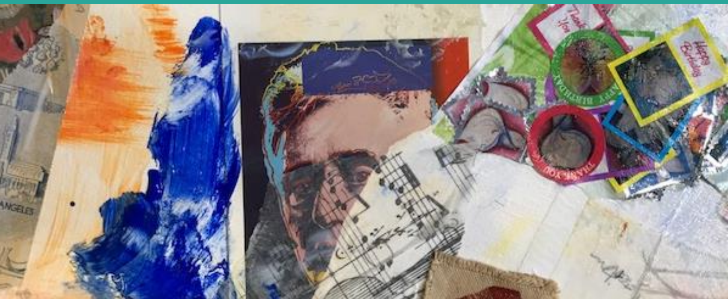
Detail from collaborative collage, CAA general meeting Sept 22 2017