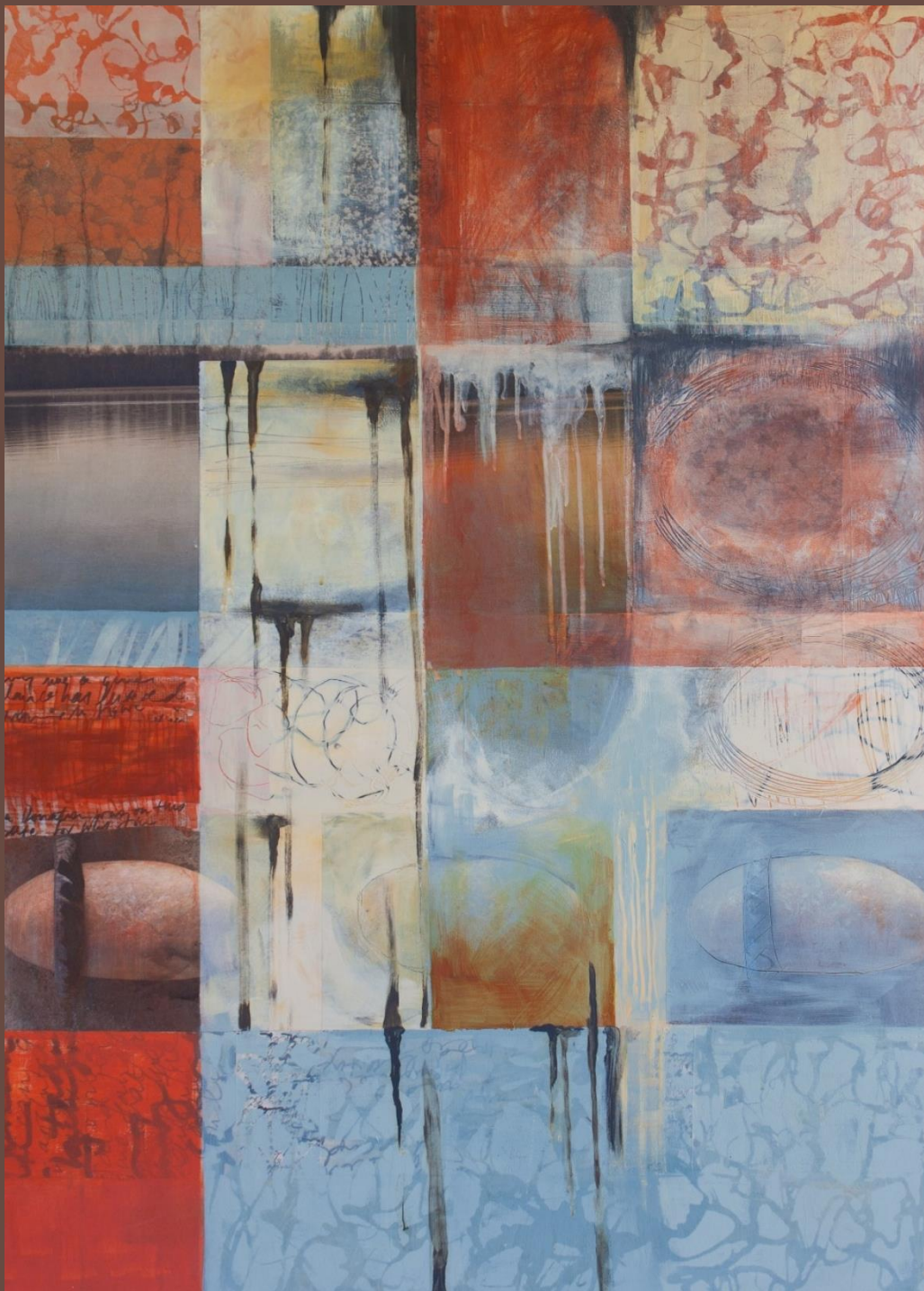
Kathy Leader, Bound Stones , 2017, 48x36x1.5, acrylic, collage on wooden panel

What are the three most important art lessons that you would impart to an adult budding collagist? In my art process classes and workshops I encourage collage artists to 1. allow the process to unfold organically rather than having a firm plan, this allows for the unconscious mind to enter into your work. 2. Don't be seduced by too many materials. Choose a few and explore them thoroughly. 3. Limit your color palette. Many collage artists feel that they have to include everything in their piece, including all colors of the rainbow!