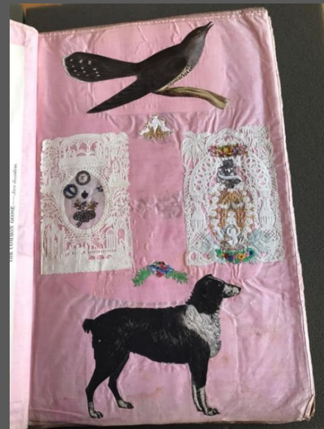
Anonymous pink silk scrap album 19th century Yale Center for British Art Image by Freya Gowrley

http://kolajmagazine.com/content/content/calls-for-artists/call-for-papers-collage-montage-assemblage-1700-present/